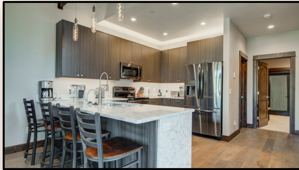
Kitchen & Breakfast Bar