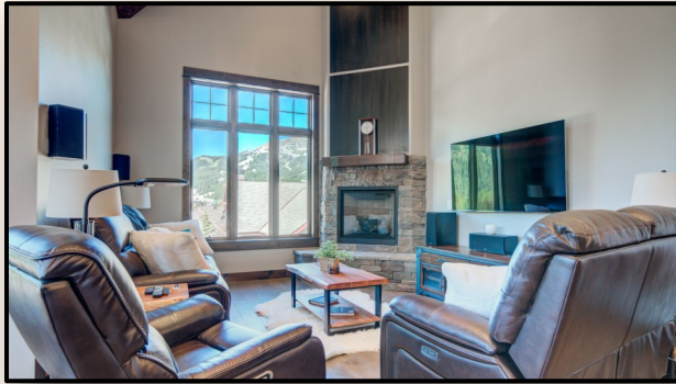
Living Area, Fireplace & Views