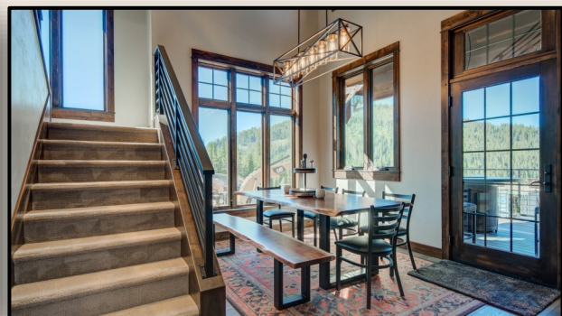
Dining Area & Deck Views