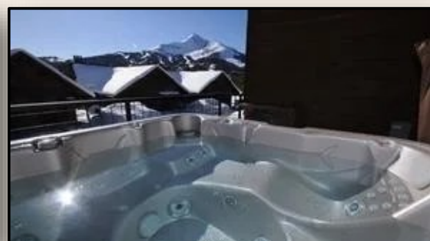
Deck Hot Tub with View of Lone Mountain

All information furnished herewith was provided by third parties and while deemed reliable is not guaranteed. Independent investigation before purchase is recommended. Price and availability subject to change without notice.