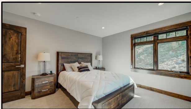
Bedroom Main Floor